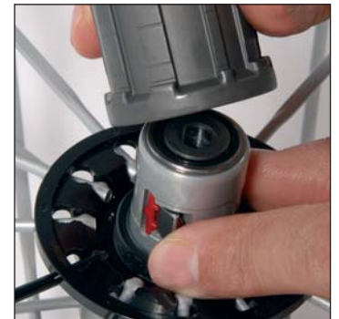
Fit the spacer washer to the hub body bearing, lower the pawls and refit the free wheel body to the hub.

Refit the axle following the procedure for the hub in question (refer to www.tech-mavic.com or the technical manuals from previous years).