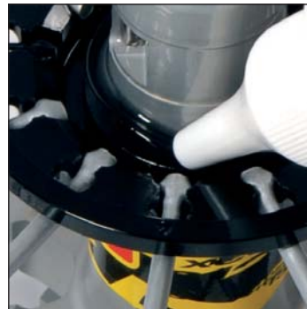
Lubricate the toothed area inside the free wheel body such that 2 to 3 grooves of the free wheel body are filled. Also place a drop of Mavic mineral oil M40122 on the seal lip.