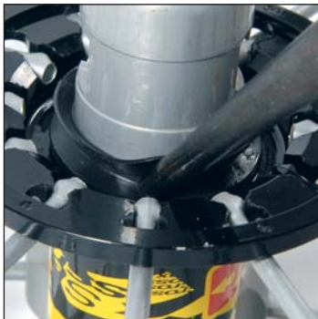
Push the lip seal fully home into the hub body by pushing it between the base and the lip using a pointed, non-cutting tool.

Meticulously clean the hub body, the pawls, the free wheel body, the spacer washer and the lip seal.