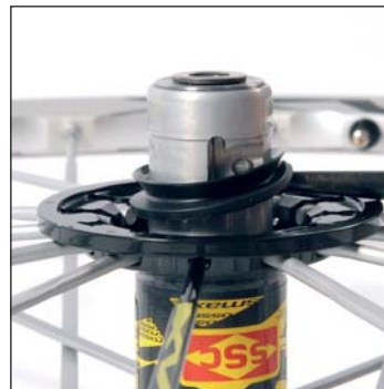
Carefully remove the lip seal using a pointed, non-cutting tool.

Meticulously clean the hub body, the pawls, the free wheel body, the spacer washer and the lip seal.