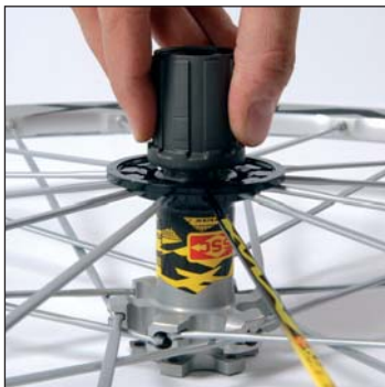
Remove the free wheel body by turning it anti-clockwise.

Remove the axle following the procedure for the hub in question (refer to www.tech-mavic.com or the technical manuals from previous years).